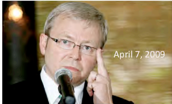
Kevin Rudd: 'Superfast national broadband network is the most ambitious, far-reaching infrastructure project undertaken by an Australian government.'

The Australian government today launched an ambitious plan to make Australia one of the world's most wired countries in a massive project to extend broadband internet access across the country.